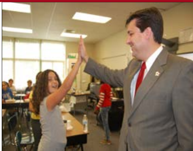
Former Senator Rouzer high-fives one of the many fifth grade students he visited at the Career Cafe.

their personality category during upcoming lunches for throughout the remainder of the school year.